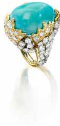
11 A DIAMOND RING, DAVID WEBB of bombé twist design, pavé-set with round brilliant-cut diamonds; signed Webb ; estimated total diamond weight: 8.80 carats ; mounted in platinum and 18k gold ; size 5 1/2 $5,000 - 8,000